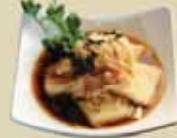
Age Dashi Tofu