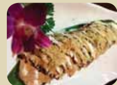
Ultimate Sticy Rice