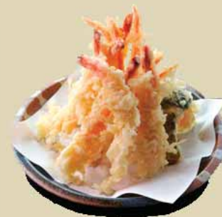
Shrimp & Vegetable Tempura