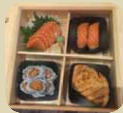
Salmon Lovers Box