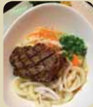
Grilled Beef Udon