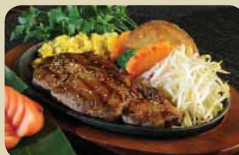
Rib-Eye Steak Teriyaki