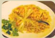
Chicken Yaki Udon