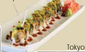
Tokyo Monster Roll