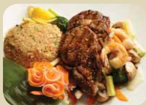
Rib-Eye Steak Habachi