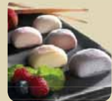
Mochi Ice Cream