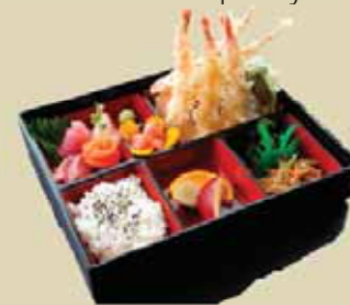
Bento Box Dinner

Bento Box Served w. Shrimp & Vegetable Tempura, Salad, Hibachi Rice and 2pcs Gyoza