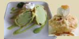
Ice Cream Tempura