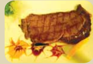
Rib-Eye Steak Side Order