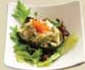
Crabmeat Avocado Salad